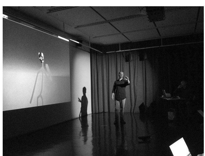
Fig 1. Masque et Avatar, Cluster Workshop. An actor in a commedia dell'arte mask and an on-screen avatar in a white mask.