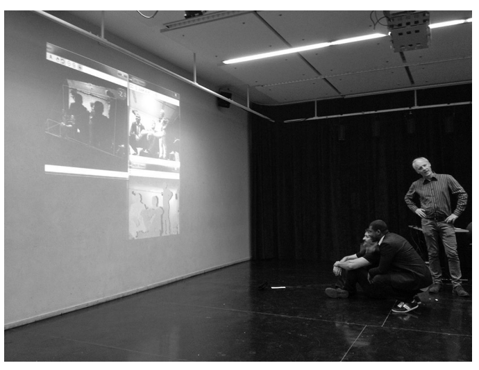
Fig. 4: Masque et Avatar, Cluster Workshop, space arrangement.

This stage of the research was meant to test the potential expression and interaction in various configurations, primarily between the performers (student-actors from GenteGente!! and theater students), the characters in masks, and the avatar (which could have a human face or a white theatrical mask). as well as the audience (students, researchers, and artists). The next exercises used techniques of improvisation in masks. The space was clearly divided into the performing area and the auditorium, with the audience sitting in front of the screen (an immersive dispositive, situated on the right, Fig. 4). The transitions between these areas were smooth and the discussions between actors, students, and researcher-observers were bound by no rules. For a limited time, each participant could wear a mask and try to act in it and interact with the avatar. The workshop was recorded and the participants were asked to fill a record of their observations. The aim was to reach preliminary conclusions about the results of the workshop and this phase of the project, while gathering material to be stored in the database (which has not yet been designed to be interactive). Georges Gagneré has created the Tiki platform, on which he gathered a large portion of the materials (recordings, journals written by directors and actors, photographs, and drawings), but it is accessible only to the project participants who have an access code.