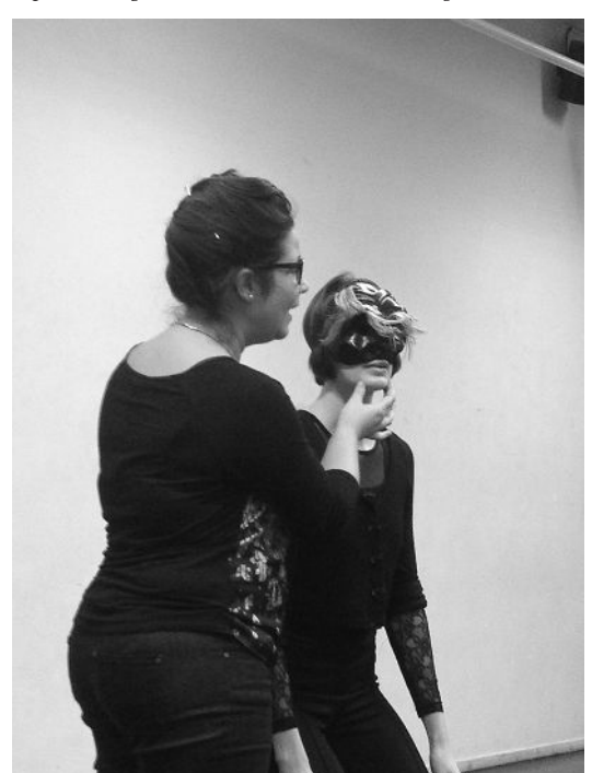
Fig. 2: Masque et Avatar, Cluster Workshop.

An interesting moment of this meeting was the presentation by The Masque Collective, demonstrating a dispositive that projects a mask and can be worn by an audience member. It was a metal construction with a screen in the form of a mask and a miniature projector. The whole device can be attached to the body with belts. The user can see a chosen mask on the screen, which is also visible on the outside